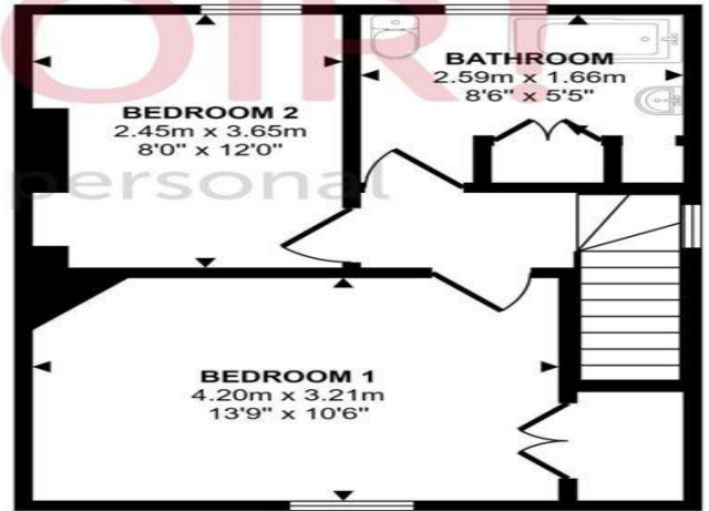
First Floor Approx 36 sq m / 389 sq ft

This floorplan is only for illustrative purposes and is not to scale. Measurements of rooms, doors, windows, and any items are approximate and no responsibility is taken for any error, omission or mis-statement. Icons of items such as bathroom suites are representations only and may not look like the real items. Made with Made Snappy 360.