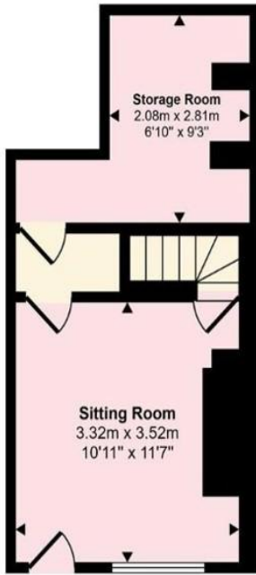
Ground Floor Approx 23 sq m / 248 sq ft