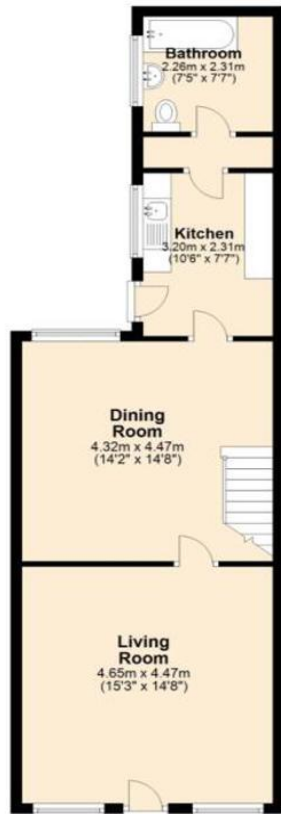
Ground Floor Approx. 55.2 sq. metres (594.6 sq. feet)